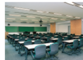
Class room (70 people)