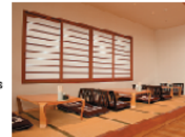
Cafeteria (Japanese style tatami mats)