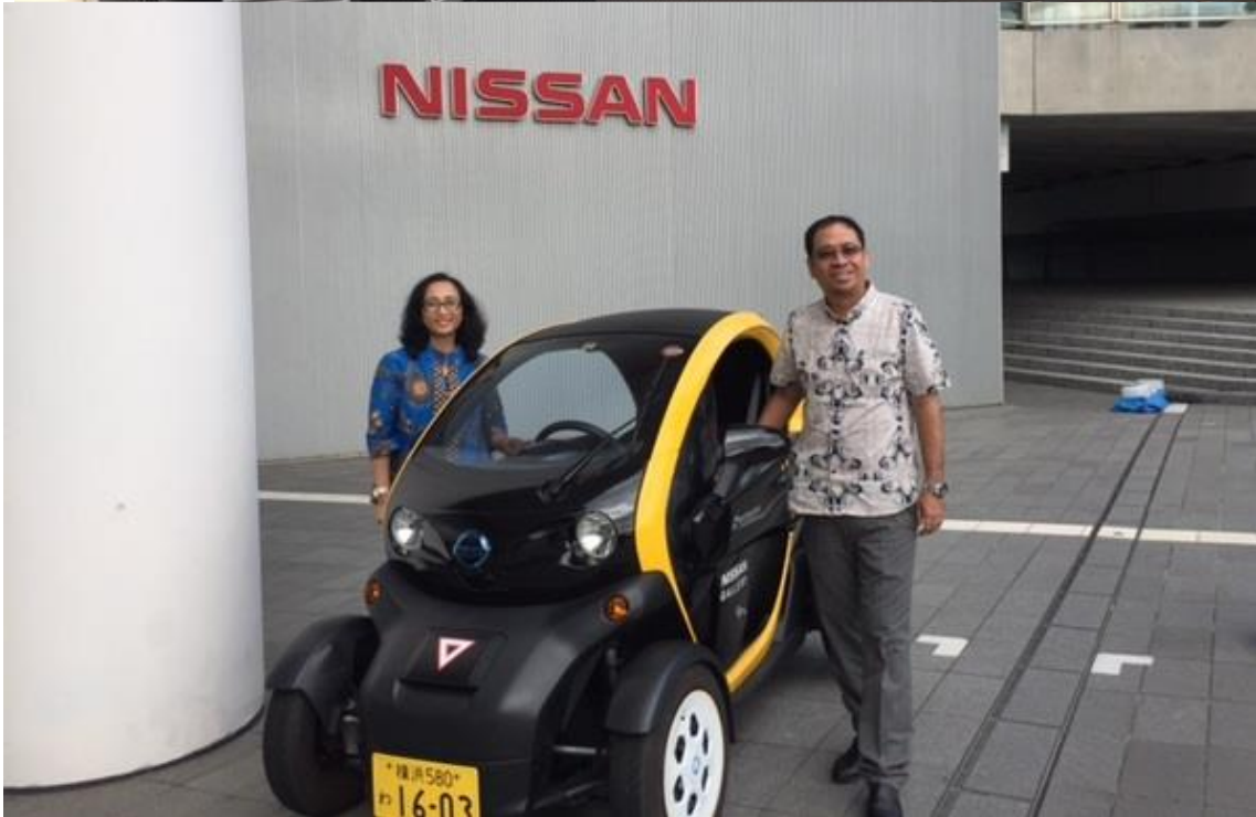
(Nissan Global Headquarters Gallery, Yokohama City, Japan)